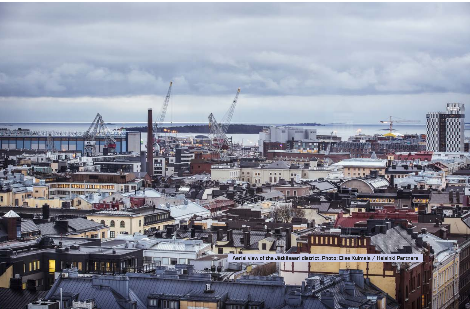
Aerial view of the Jätkäsaari district.